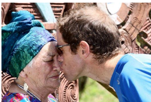
Enthusiasm an advantage..??